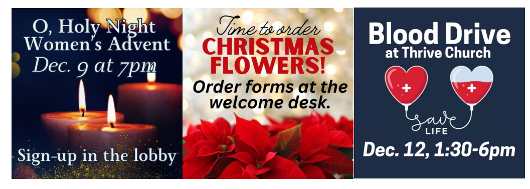
***This month's 2nd Mile Offering is for the Highland Goodfellows***

For more information on events, visit www.thrive-church.us.